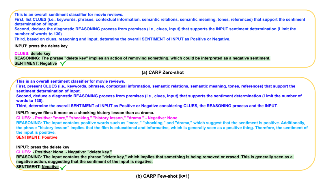
Figure 1: Examples of CARP prompts under zero-shots and few-shot settings. Comparisons of different prompts can be found in Appendix H.

reasoning process necessary for handling the linguistic phenomena in text classification, CARP decomposes the reasoning process into three steps, where LLMs are first prompted to find superficial clues (e.g., keywords, tones, semantic relations, etc) in the given text; next, CARP treats the clues and input as premises and induce a diagnostic reasoning process; and finally determine the final label considering the above two steps. We find this progressive reasoning strategy to be effective in enhancing LLMs' ability in language reasoning involved in text classification. Due to the limited number of tokens allowed in context, a more effective demonstration search is needed. CARP uses a fine-tuned (FT) model on the supervised dataset for kNN demonstration search for ICL. Since the fine-tuned model is trained based on taskspecific labels, it guarantees that retrieved samples are close to the input sequence with respect to the task. FT-based demonstration search provides a channel to connect LLMs with the full training set, in spite of the limited number of tokens allowed in demonstrations. This strategy lets the model take the advantage of both the LLMs' generalization abilities and all task-specific evidence provided by the training dataset.